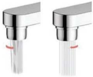
Dual Spray Aerator Twist to change

SINK MIXER - MAINS PRESURE Fitted with the dual spray aerator .