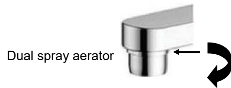
Dual spray aerator