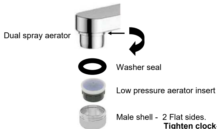
Male shell - 2 Flat sides. Tighten clock-wise. Remove anti clock-wise.